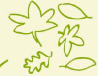
Leaves (ones on the ground that are brown)